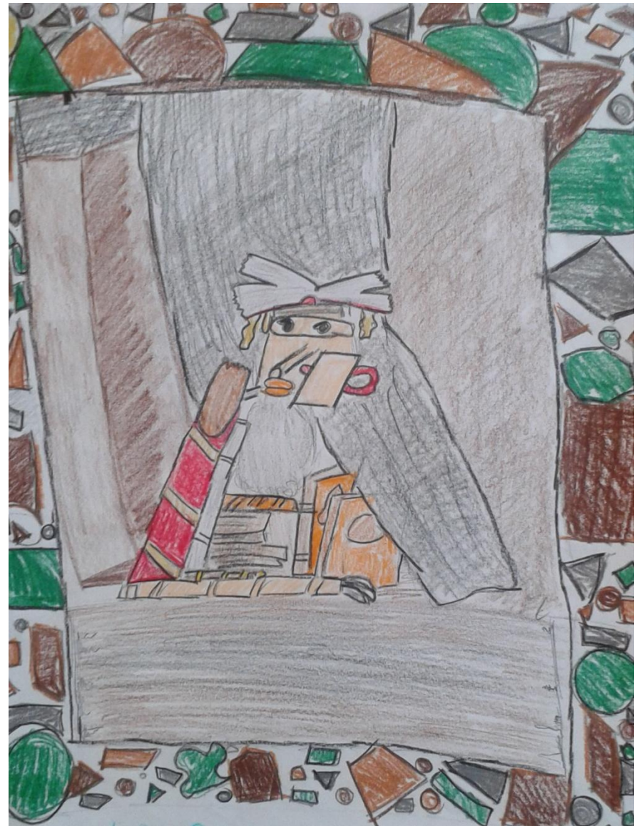
ARCIMBOLDO'S LIBRARIAN AND OURS